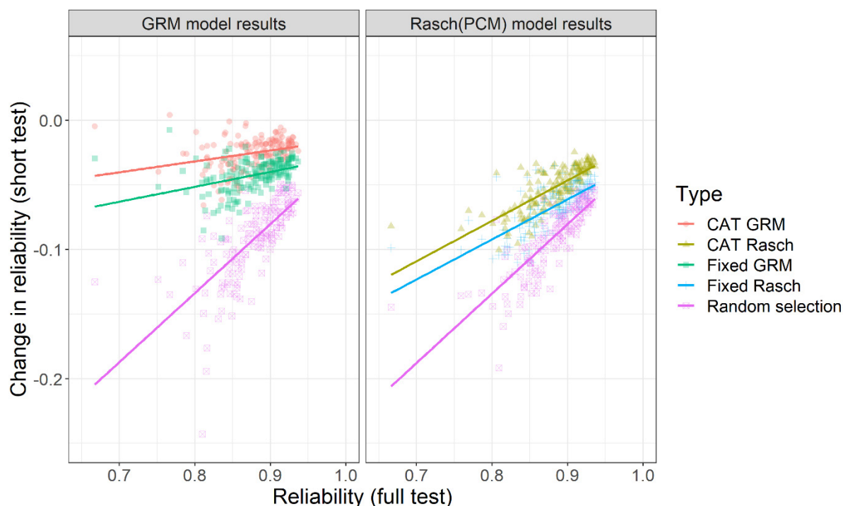
Figure 1: Original full-length test reliabilities and changes in reliability under each of the methods for selecting a subset of items for use with each student. Regression lines have been added to aid interpretation. Results are split by the IRT model used to calculate reliability.

student. Among the two fixed form approaches in each panel of Figure 1, selecting items in an optimal manner based on an IRT model led to higher reliabilities than selecting items at random.