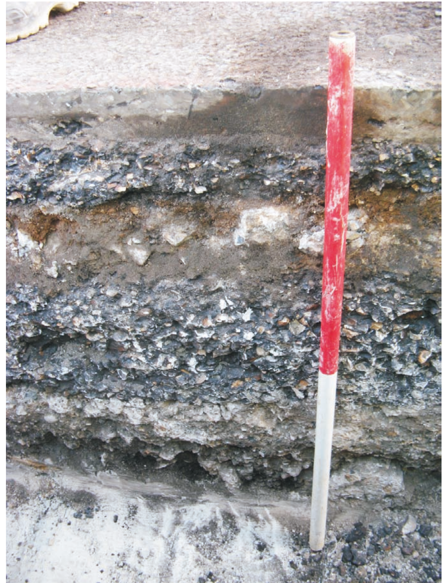
Figure 3. Pipeline cross-section