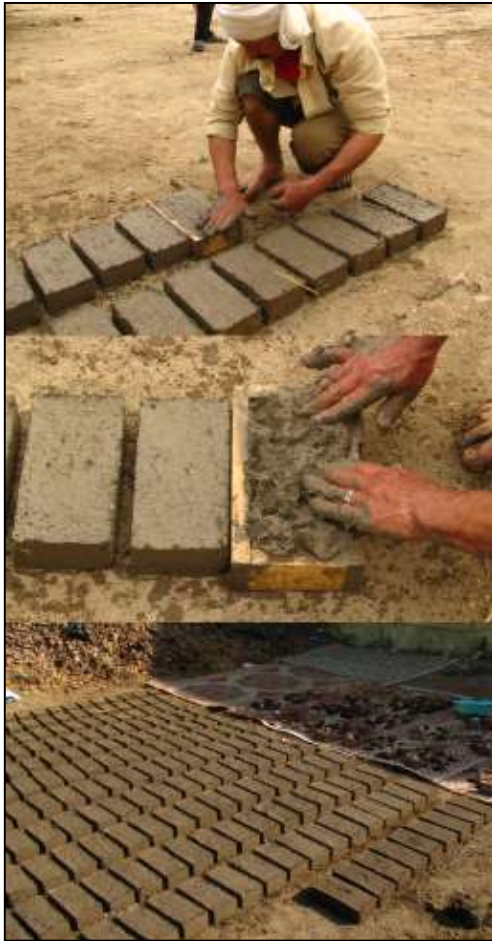
Figure 5: Experimental brick forming and drying.