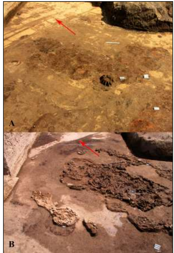
Figure 2: Brewery center at Western Kom at Tell el-Farkha surrounded by an organic fence (a) and later by a mudbrick wall (b).

Exact reconstruction of the ancient production process may not be possible. However, ancient Egyptian scale models, real brick moulds and scenes depicted in contem-