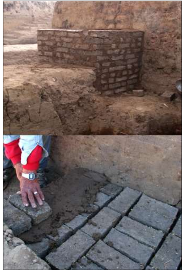
Figure 6: Construction of mudbrick wall as an addition to mastaba.

during production was much higher than we initially thought at the drying stage (from 24x12x6cm at the beginning to 22x10.5x5cm). The shrinkage continues later during seasoning. In general, mudbricks lose as much as one third of their volume when compared to the initial paste.