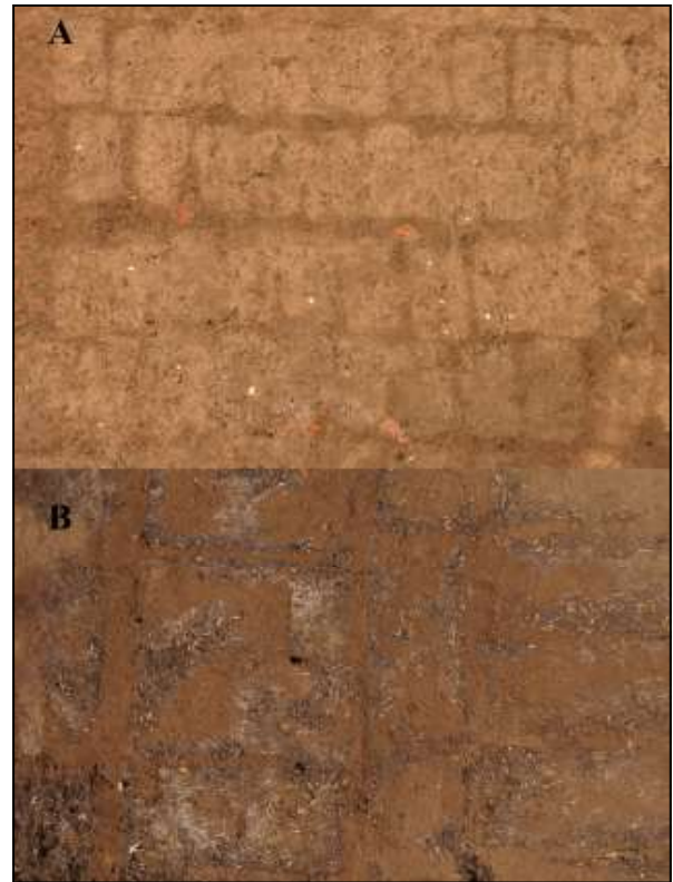
Figure 7: Brick arrangement in (a) the Grave 55 from Tell el-Farkha and (b) reconstruction wall after some years.

Our most important observations are related to the widely underestimated stage of seasoning, the problem of accessibility of space for brick drying and transportation of ready-to-use bricks from the manufacturing place to the construction site—which might have been one of the most difficult technical parts of the complex undertaking. Another important outcome was our ability to calculate numbers