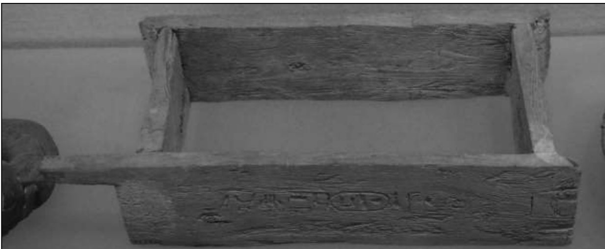
Figure 4: Brick mould from a foundation deposit for Hatshepsut's Temple, 18 th dynasty, New Kingdom, at the display in the Metropolitan Museum (acc. no. 22.3.252).

Museum, acc.no. 51); a brick mould from a foundation deposit for Hatshepsut's Temple dated to Dynasty 18 during the New Kingdom (Metropolitan Museum, acc.no. 22.3.252; fig. 4); and, finally, a model brick mould with the cartouche of Tuthmosis III from Gebelein also dated to Dynasty 18 (Museo Egizio in Turin, s.12448). A similar mould is presented on the relief on the wall of Red Chapel at Karnak, in the scene of brick making for a new temple performed by Queen Hatshepsut (Burgos and Larché 2006). All of the examples present the same shape—a