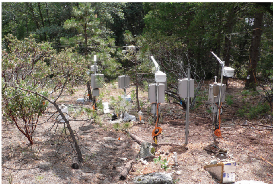
Figure 1. Experimental forest with sensors, photo by author.

and search engines for contributing to reforestation initiatives.