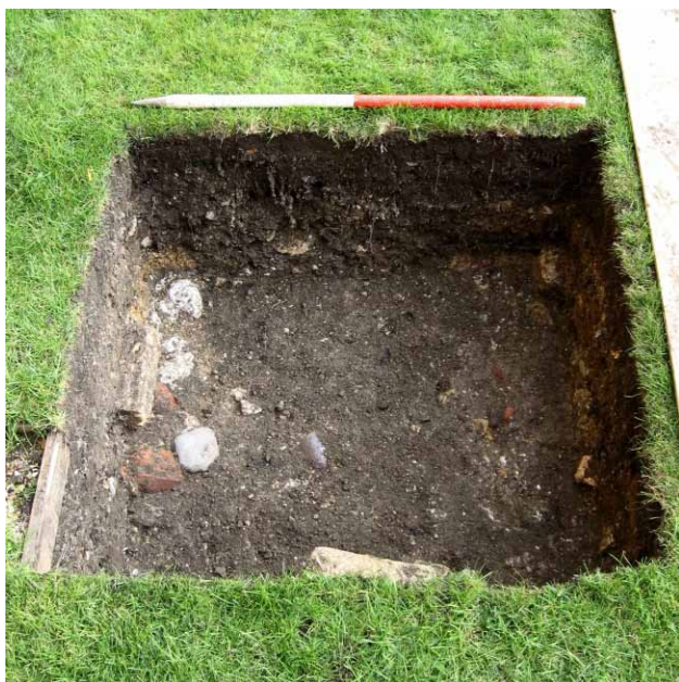
Test Pit 5: Looking southeast