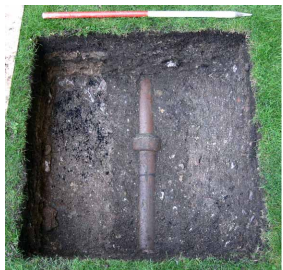
Test Pit 6: Looking northwest