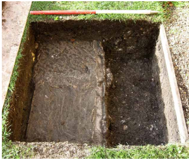
Test Pit 3: Looking northwest