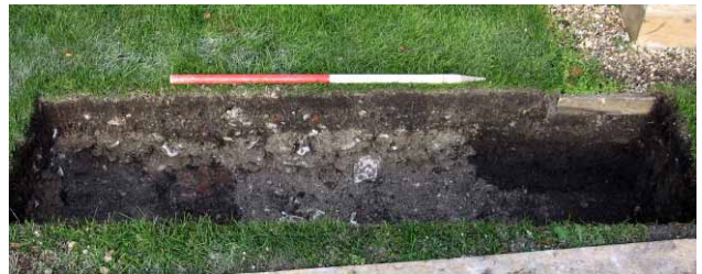
Test Pit 4: Looking northeast (produced at smaller scale)