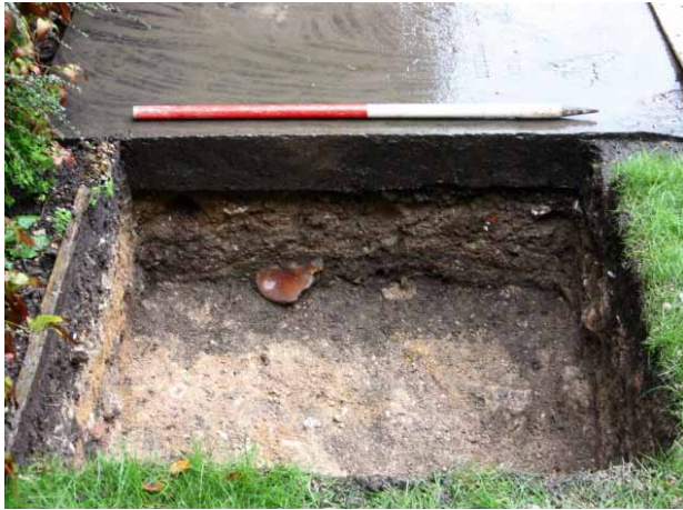
Test Pit 1: Looking southwest