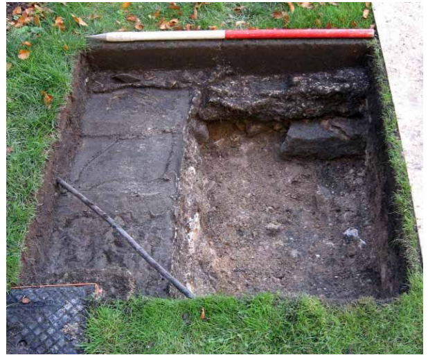
Test Pit 2: Looking southwest