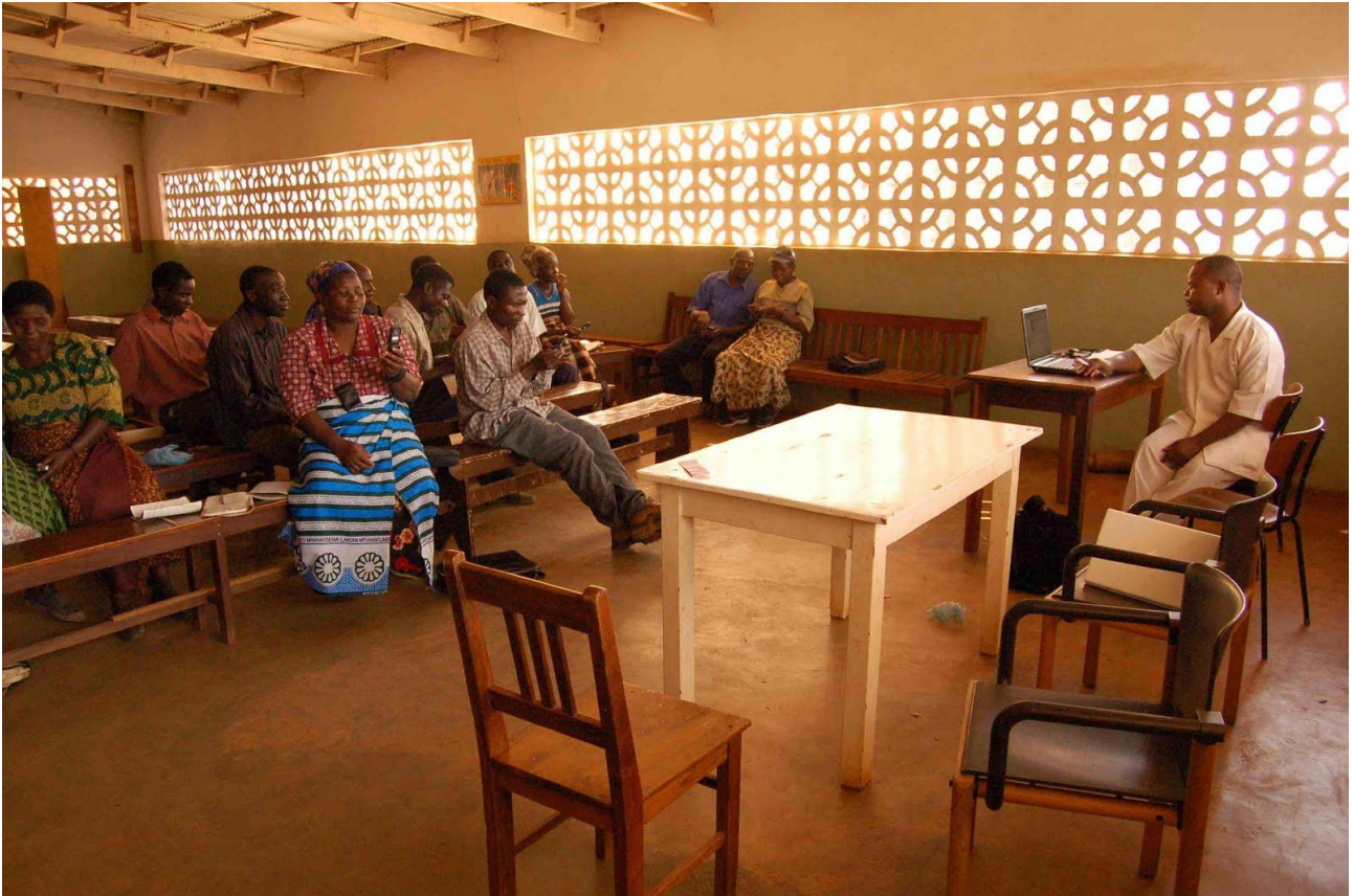
Image 1: Community Health Workers at St Gabriel's Hospital in Malawi attend an mHealth training session with Medic Mobile.