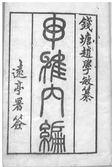
Figure 2: Chuanya neibian , woodblock edition from 1897. Copy kept in NJUTCM. Photo by author, September 12, 2017.