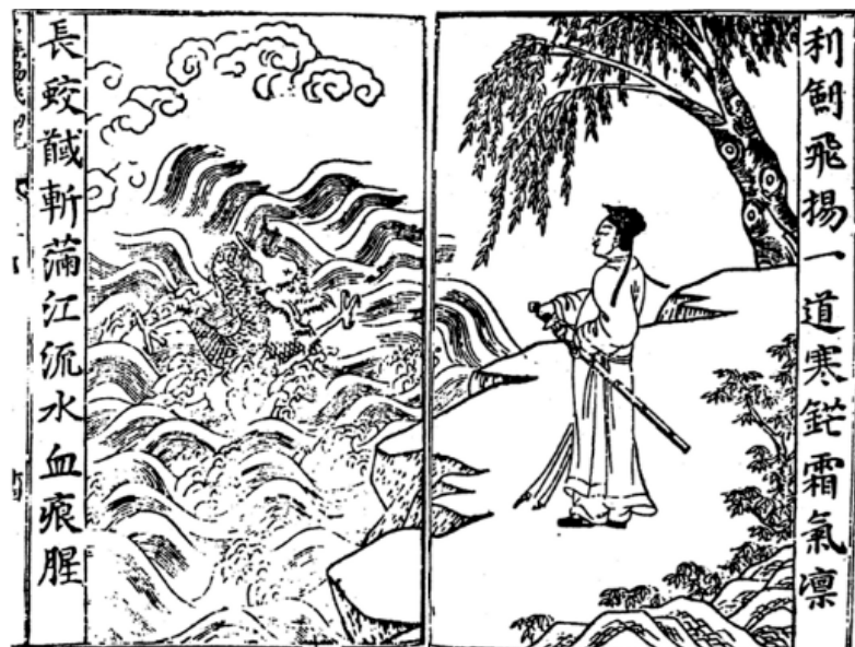
Figure 5. Lü Dongbin confronts a dragon in The Flying Sword .