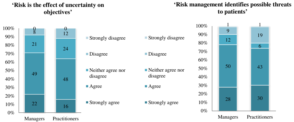
Figure 1a: Risk definition