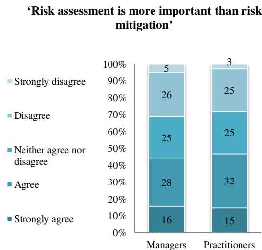
Figure 2 Risk management strategy

A following question was asked: “to what extent do you agree that risk assessment is more important than risk mitigation?” to understand respondents’ priority. While 47 percent of practitioners considered risk assessment as being more important than risk mitigation, 44 percent of managers agreed with the same statement. Although it is arguable that which of these should be a priority, risk management priority should be more likely to reduce risks. When results were compared based on locations, again similar responses received from different countries except UK managers and practitioners agreeing slightly more. Figure 2 below illustrates the overall responses to the given statement.