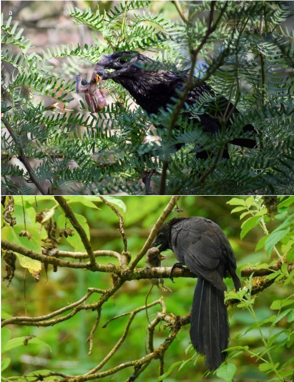
Figure 5. a) A smooth-billed ani with a nestling it had just taken from a nest believed to be that of a small ground finch Geospiza fuliginosa , on Santa Cruz. b) A smooth-billed ani with an introduced mouse in its bill which it had caught alive and killed