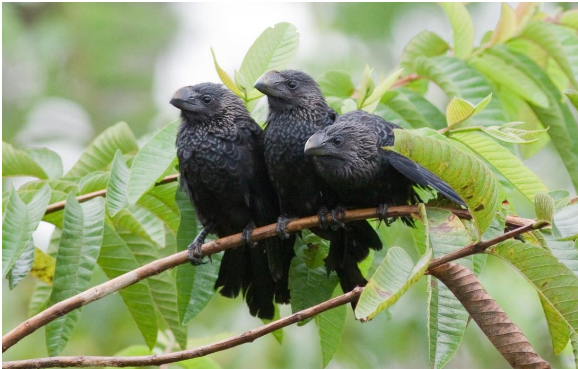
Figure 1. A group of three smooth-billed anis in Galápagos

Answering these questions is a necessary first step towards deciding whether management of this species is a priority and, if so, what specific actions may be needed. Collating this information will also identify knowledge gaps vital to fill if such management decisions are to be properly informed.