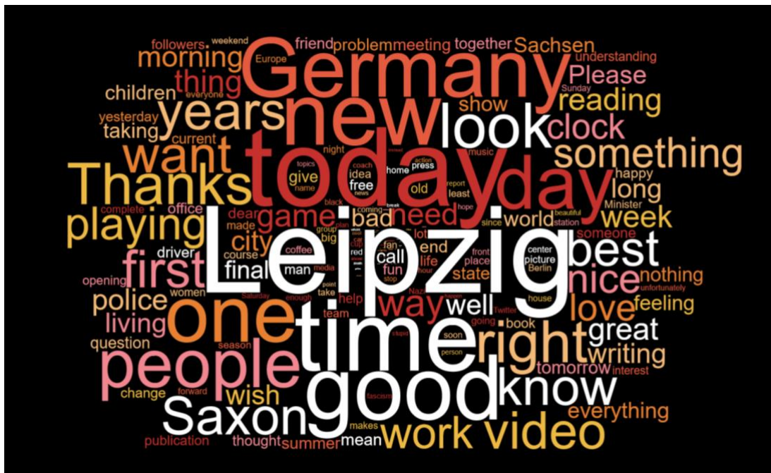
Figure 4-2: Word cloud of sample tweets of May to September in Leipzig