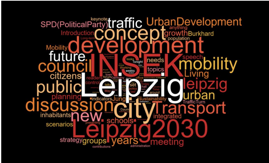
Figure 4-4: Word cloud of all policy-related tweets