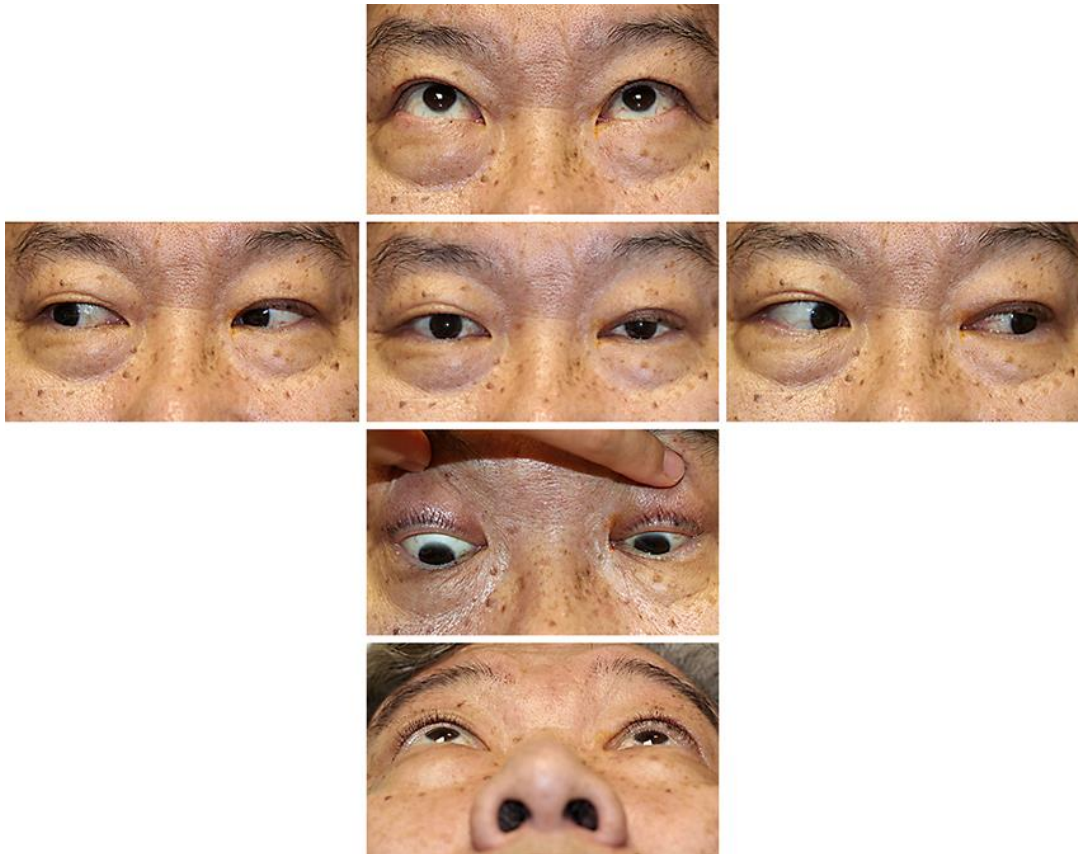
Fig. 3. Post-operative photos on day 13 showing persistence of good extraocular motility, with slight left-sided ptosis and resolution of proptosis.