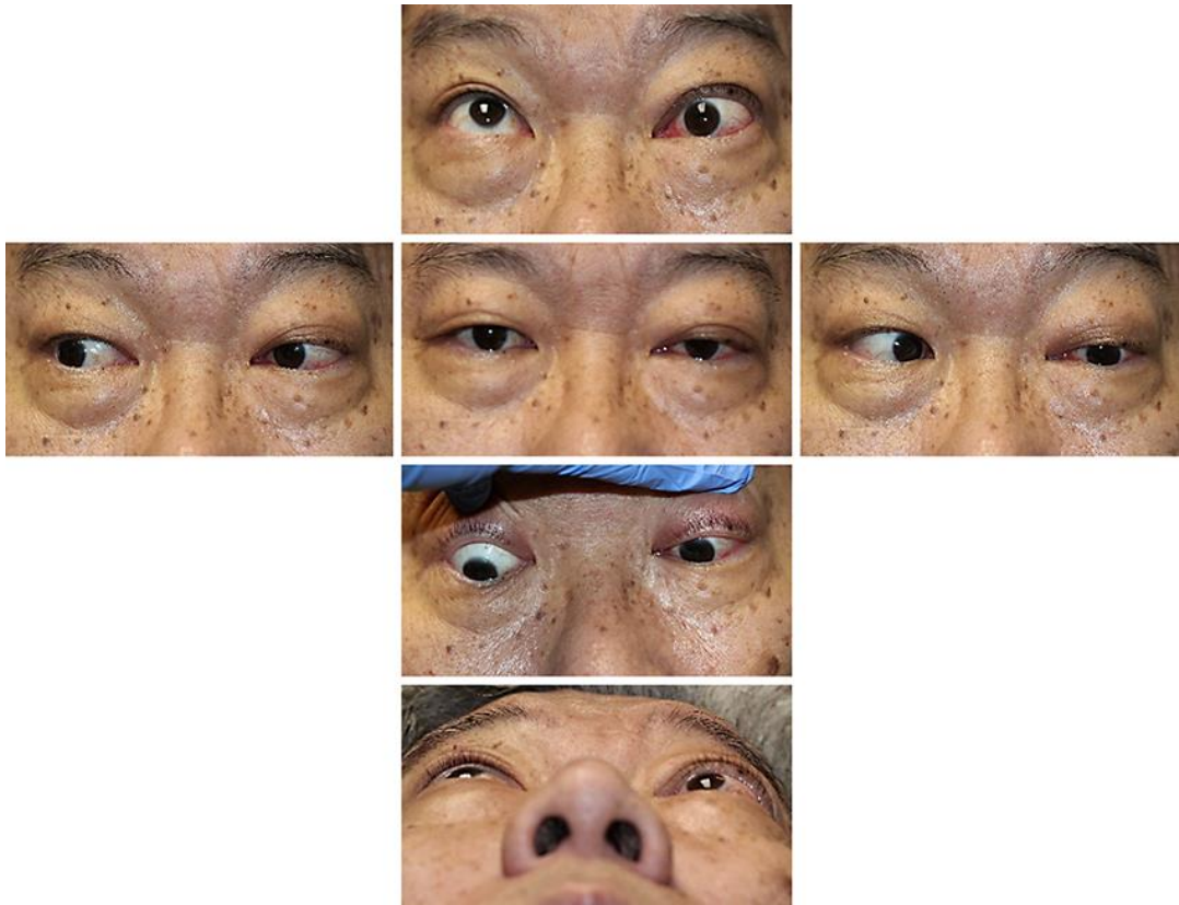
Fig. 2. Pre-operative photos showing left-sided proptosis, conjunctival hyperaemia, and lateral gaze palsy.