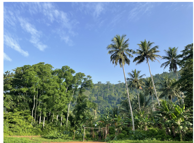
Figure 1: The community forest in the Bosomtwe Range Forest Reserve, Asante Region Ghana.

This research was conducted in a community on the fringe of the Bosomtwe Range Forest Reserve (BRFR) of the Asante Region in Ghana, pictured in Fig 1. BRFR is classified as a Key Biodiversity Area (KBA) and Important Bird Area (IBA) by BirdLife International [10, 40] and covers an area of 79 km 2 .