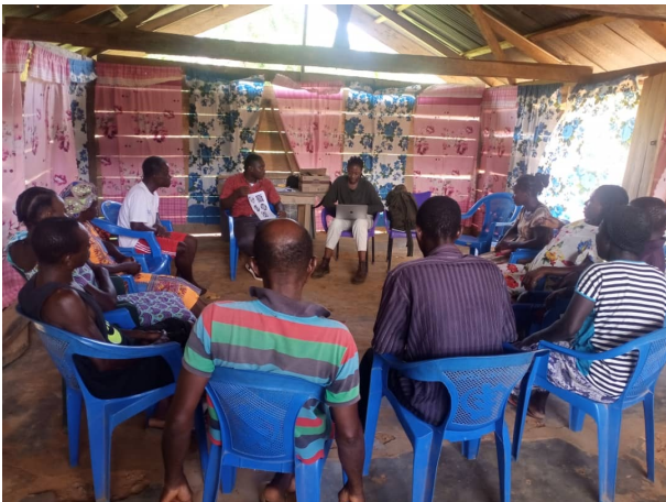
Figure 4: The FA and community members discussing the Ghanaian cultural Adinkra symbols.

In order to provide relief from the taxing and drawn-out sessions that involved drawing, sketching and collaging, a previously planned discussion session based on the Adinkra (see Fig 4), Ghanaian cultural symbols that communicate important proverbs, was brought forward in the research schedule. During this session, community members became highly animated and passionate, sharing ideas back and forth and recounting in detail their perspectives on the teachings of each of the five Adinkra we focused on during the two-hour session. For example, upon seeing the Sankofa Adinkra (see Fig. 5), which “teaches the wisdom in learning from the past to help improve the future” [3], community members shared how the past was being carried forward in the ecological practices.