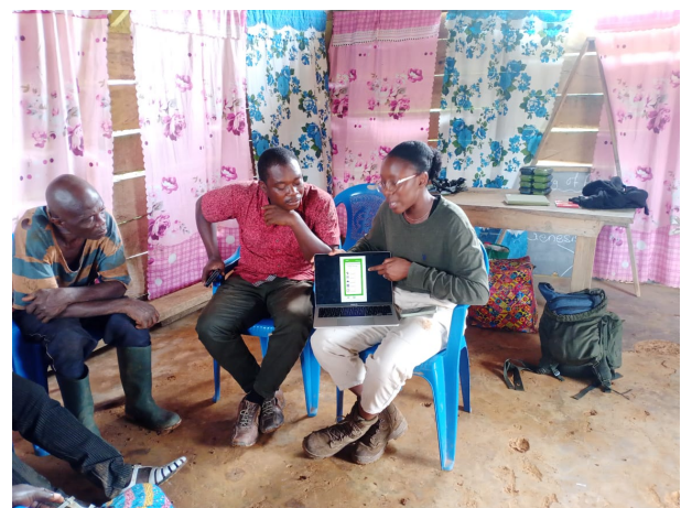
Figure 6: The FA presenting the ecotourism app sketches and responding to feedback.

Rather than set an expectation for an artefact draft or design by community members within the session, the designer would save this work for the ‘between-time’, ready to present an iteration at the next session. It was through this process, of using the ‘in-between’ phases in the design process that the necessity of the mode of Transformation became apparent. Transformation, not only of community member’s thoughts, concerns and ideas into designs to aid more engaged and generative design engagements but also to create a sense of trust and excitement in community members. Transformation became a sign of care and an honouring of the agency of community members to shape the design focus.