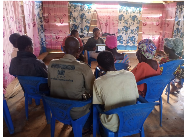
Figure 3: Community members giving feedback on the interactive t-SNE interface to the FA

In contrast to this conversational and highly engaged session, the paper prototyping session saw community members become withdrawn, quiet and reserved, unable or unwilling to express direct opinions or ideas. Whilst the FA endeavoured to provide as many resources as possible for this session, including pens, pencils, crayons, A1 paper and a booklet of images of local wildlife, plant life, cultural symbols and data representations, community members did not touch the pens or crayons at all. Instead, they opted to cut out images of the wildlife and match them to the different crops they eat and where in the forest, using the map, they could be found. Despite the activity being completed, it was clear that there was a lack of interest and enthusiasm in the session. Having undertaken a long-term collaborative practice with the same community members over two field seasons, the FA had become