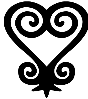
Figure 5: The Sankofa Adinkra symbol

“we continue to believe that if you disobey the taboo and visit the water bodies on sacred days, that it is not good and you will see things you are not supposed to see”.