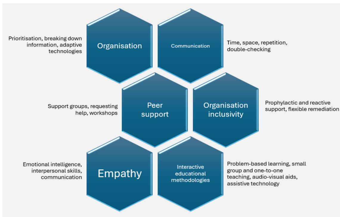
FIGURE 2 Diagram outlining strategies used to reduce difficulties with dyslexia in medical students and postgraduate doctors, with a few examples of each one.

Resources may be required for appropriate provision of reasonable adjustments in training programmes, such as universities, hospitals and/or GP surgeries. Doctors with dyslexia may be eligible for funding depending on local arrangements, such as the Access to Work grant in England. 77 The review has identified a number of