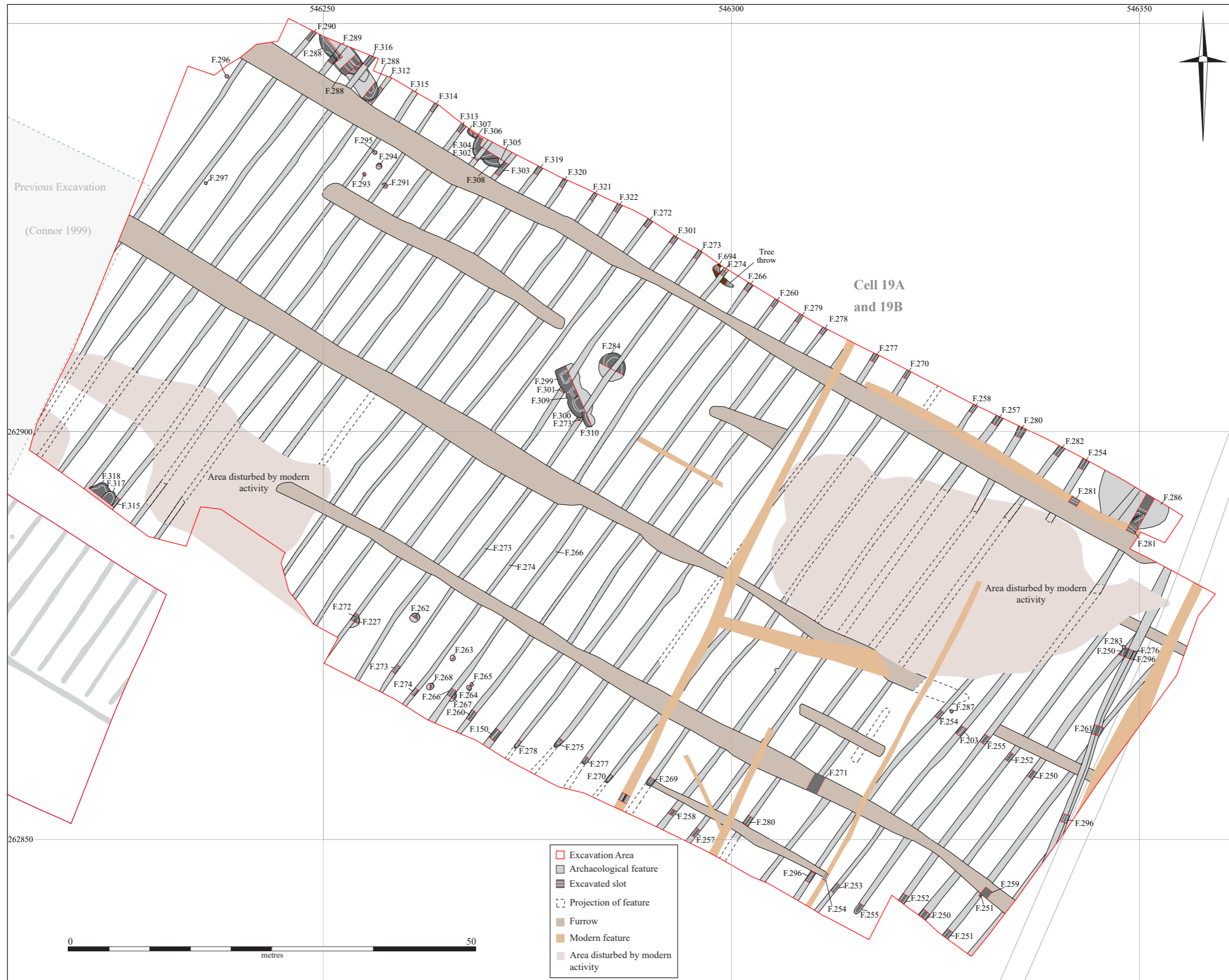
Figure 4. 2011 Excavation (Cells 19A, partial, 19B)