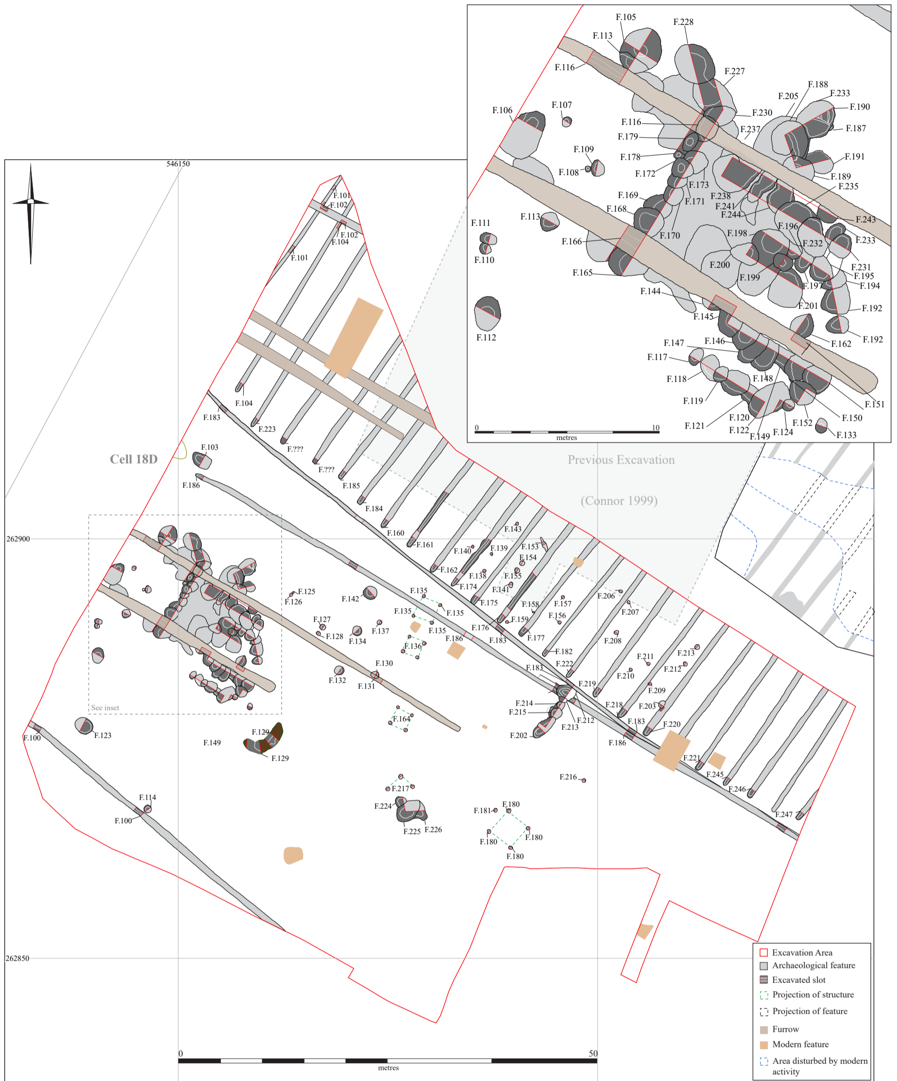
Figure 3. 2010 Excavation (Cell 18D)