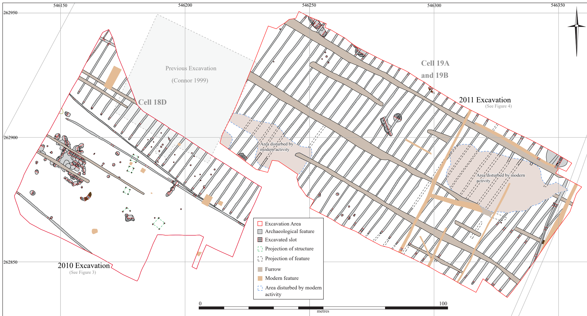
Figure 2. Plan showing 2010-2011 Excavation Areas