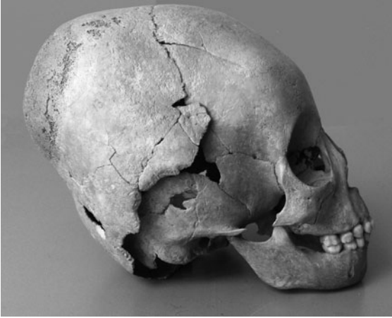
Fig. 3. A modified skull of a child, unknown provenance.

and elongate the parietal bone. When the bones are fused, this shape remains a permanent feature of a person's appearance. The practice first arose west of the Tian Shan mountains in the 2nd c. BCE, spreading westwards to the northern Black Sea region at the turn of the millennium and reaching central Europe by the 5th c. CE. However, the practice is not typical for the burial complexes of Mongolia that have been associated with the Xiongnu. In central Asia, burial of individuals with modified skulls was very diverse, and it cannot be associated with any distinct