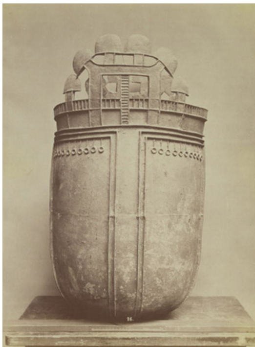
Fig. 2. An example of a “Hunnic” cauldron, found in Törtel in Hungary in 1869.

has been considerable debate about the plausibility of this link, based on written, phonological, and archaeological evidence. 20