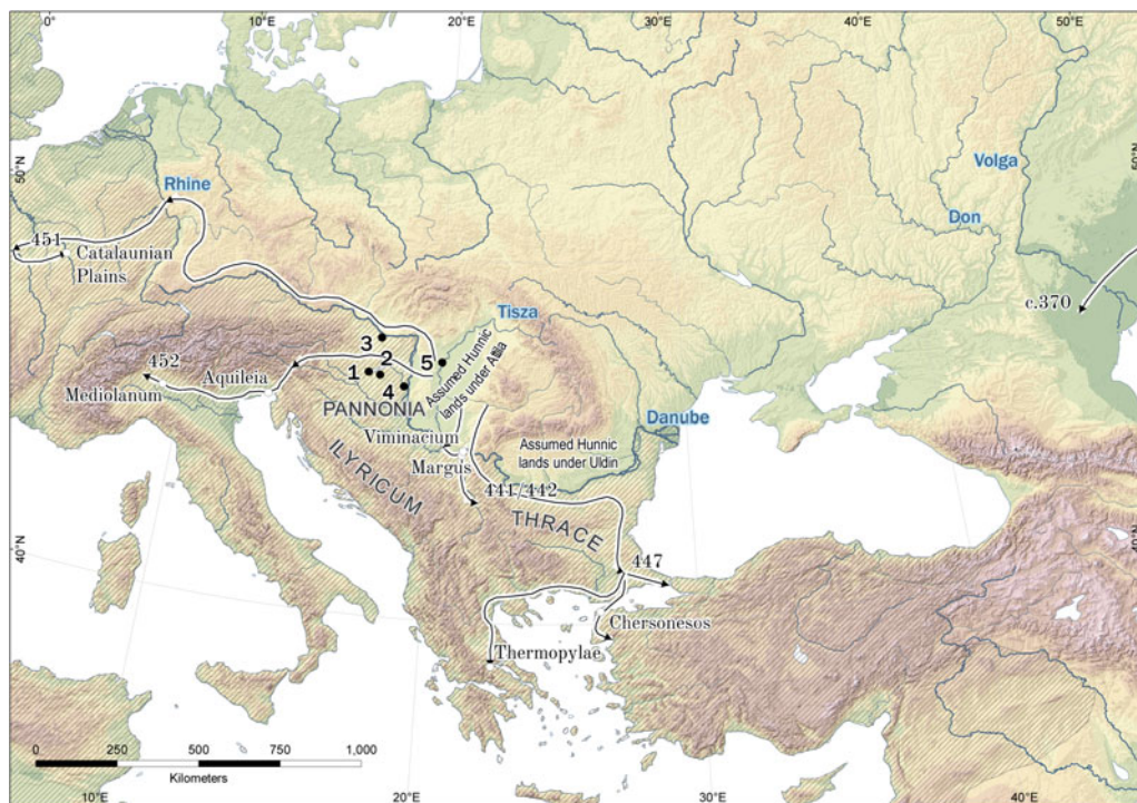
Fig. 1. Historically recorded locations of Hunnic activity. The arrows indicate the assumed routes of the main Hunnic raids. Sites sampled for isotope analysis in Hakenbeck et al. 2017: 1. Keszthely-Fenépuszta; 2. Hács-Béndekpuszta; 3. Győr-Széchenyi Square; 4. Mőzs; 5. Szolnok-Szanda. Shaded area: Roman Empire. Roman provinces map data adapted from the Ancient World Mapping Centre (Creative Commons Attribution-NonCommercial 3.0 Unported); coastline and river data from Natural Earth ( https://www.naturalearthdata.com ); elevation data from the GMTED2010 (Danielson and Gesch 2011). (Map created by David Redhouse.)

by the dreadful rumors noised abroad concerning him.” 13 By their appearance and behavior, the Huns seemed in every way opposed to Roman civilization. This negative image was perpetuated in historical scholarship and has persisted in the popular imagination up to the present day. 14