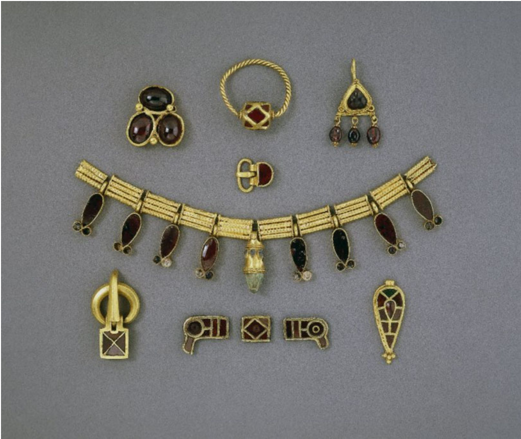
Fig. 4. Late 5th- to early 6th-c. CE objects from Kerch in Crimea showing stylistic influences from both the steppe areas north of Crimea and the Mediterranean.

rapid appearance and impact of the Huns in the Pannonian Basin. In the absence of any written information about how Huns and other nomadic pastoralists understood their identity, it is therefore more productive to approach them through their subsistence economy.