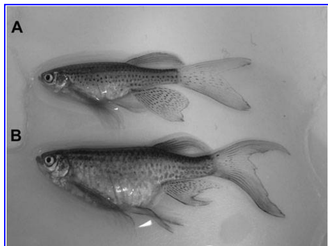
FIG. 1. Example of a descriptive annotation of a zebrafish welfare concern. (A) Normal appearance of zebrafish, (B) female with enlarged abdomen, which would be annotated as abdomen_general_distended .