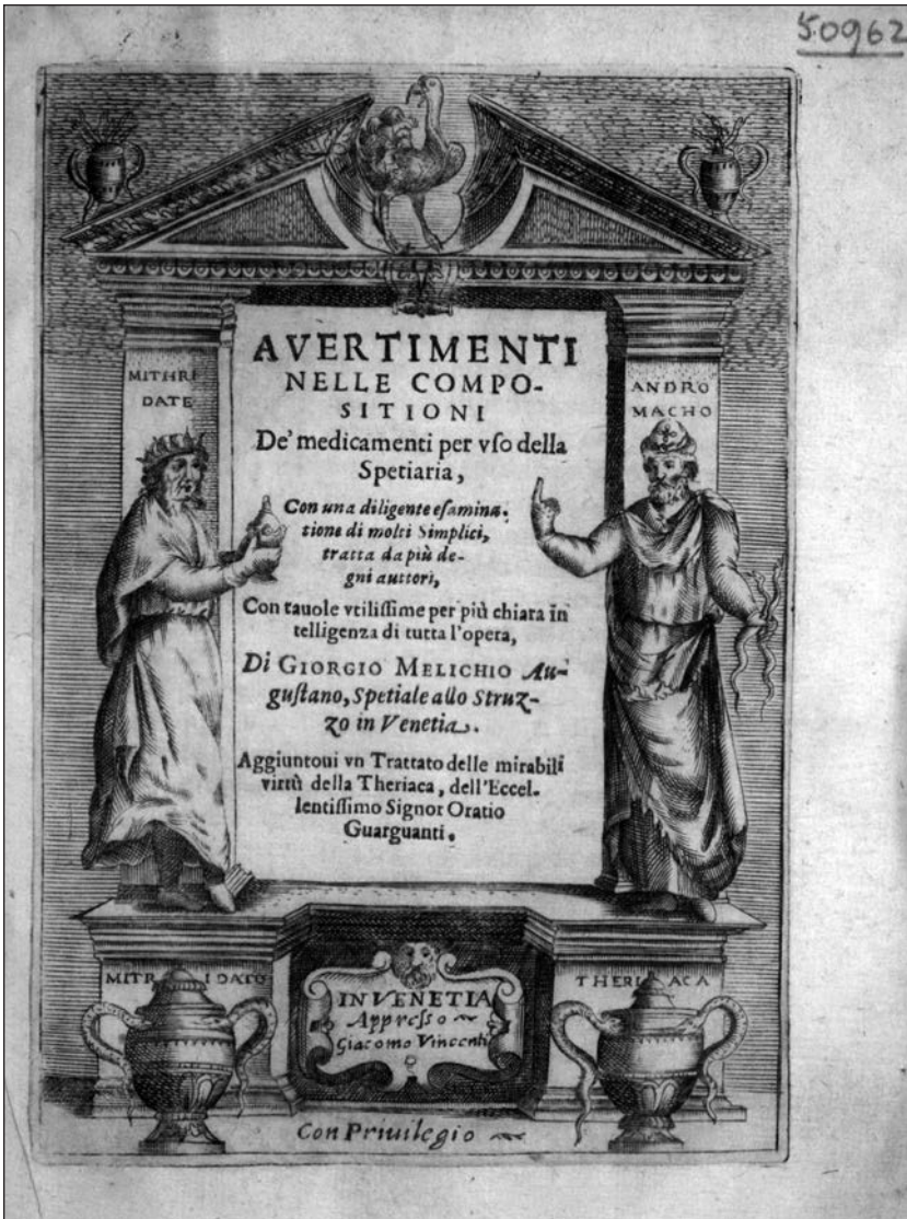
Figure 1. Frontispiece of Giorgio Melichio, Avvertimenti nelle composizioni per uso della spetiarìa (Venice, 1605), adapted from an existing design shared among Venetian print shops.

to solve confusion and standardize local practice. 42 They also went against their prescriptive spirit. This revealing aside comes from the 1639 manual of the Neapolitan Friar Donato: