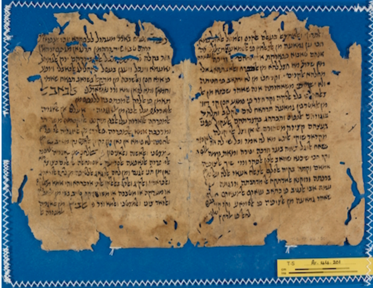
T-S Ar.44.201 recto