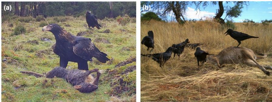
Figure 2. Avian scavengers of shot macropod carcasses include (a) Wedge-Tailed Eagles ( Aquila audax fleayi ) with a Tasmanian Pademelon ( Thylogale billardieri ) and (b) Australian Ravens ( Corvus spp.) feeding on a Western Grey Kangaroo shot in mainland Australia.

becoming more abundant (Schulz et al. 2021). Finally, these actions are also affecting private industry overseas – for example, the major U.K. game-retailing supermarket no longer stocks meat from animals shot with lead ammunition (Thomas et al. 2020).