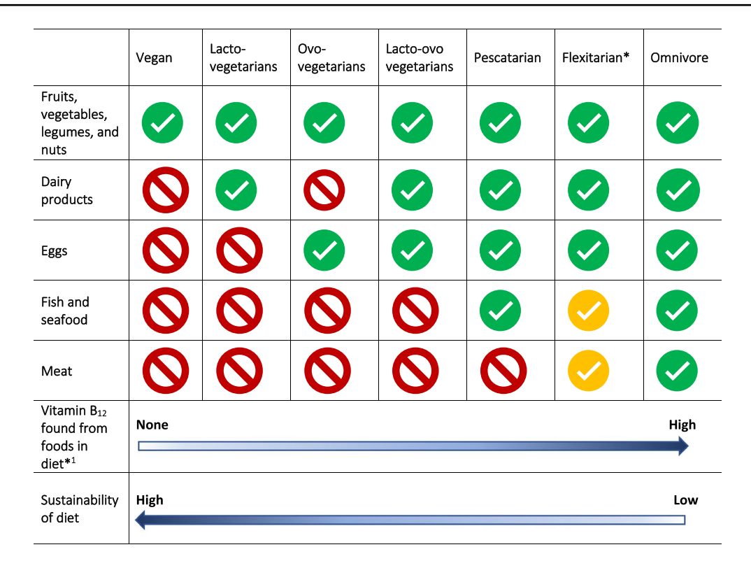
Fig. 1 Presents the pattern of consumption for different food components ranging from a vegan to omnivore diet. *A flexitarian diet may occasionally consume fish, seafood and animal products but likely limit their consumption of these foods for environmental and health reasons. *. Ishows the gradient of vitamin B_{12} found in foods from differing diets, ranging from none in vegan diets to high in omnivore (without the intake of supplements or fortified foods).

Key: \bigcirc = avoided in diet \bigcirc = occasionally consumed in diet \bigcirc = consumed in diet